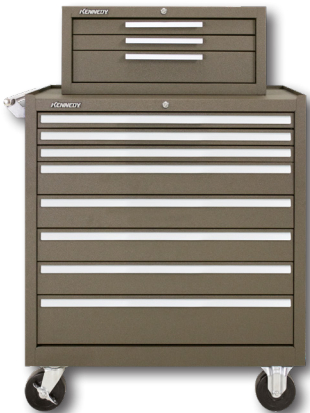
2603 3-Drawer Base 348X 8-Drawer Cabinet