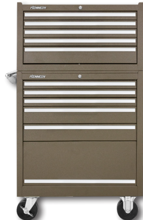
2805X 5-Drawer Chest 295X 5-Drawer Cabinet