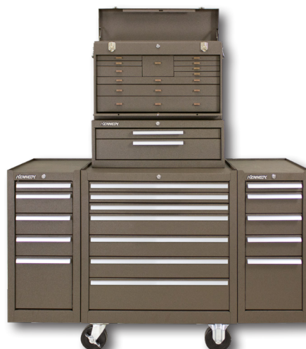
52611 11-Drawer Chest 5150 2-Drawer Base 277X 7-Drawer Cabinet 185X 5-Drawer Cabinet (x2)