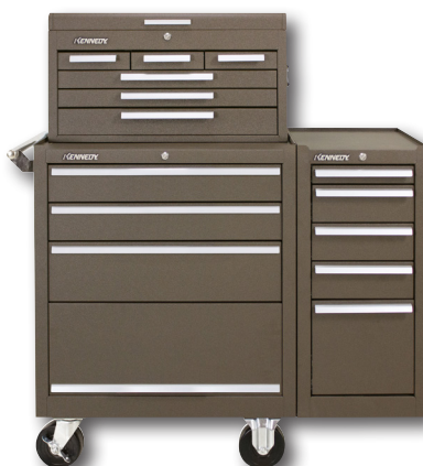
266 6-Drawer Chest 273X 3-Drawer Cabinet 185X 5-Drawer Side Cabinet

COPYCAT IS ANOTHER FORM OF FLATTERY... GO WITH THE ORIGINAL!