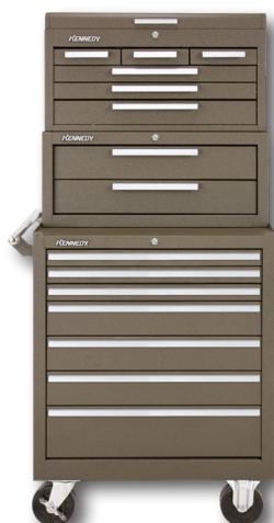
266 6-Drawer Chest 2602 2-Drawer Base 277X 7-Drawer Cabinet