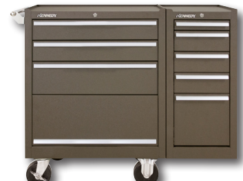
185X 5-Drawer Side Cabinet 273X 3-Drawer Cabinet Also Available in Industrial Red