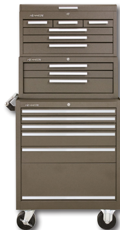
266 6-Drawer Chest 2603 3-Drawer Base 275X 5-Drawer Cabinet