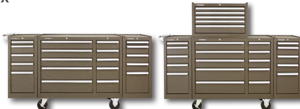
185X 5-Drawer Side Cabinet (x2) 310X 10-Drawer Cabinet