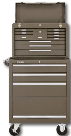
3611 11-Drawer Chest 273X 3-Drawer Cabinet