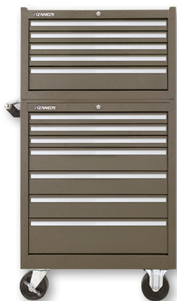
285X 5-Drawer Chest 277X 7-Drawer Cabinet Also Available in Industrial Red