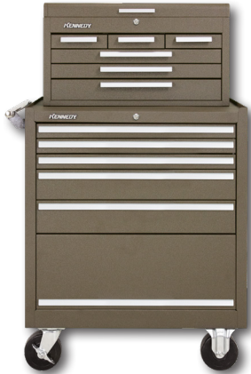
266 6-Drawer Chest 295X 5-Drawer Cabinet