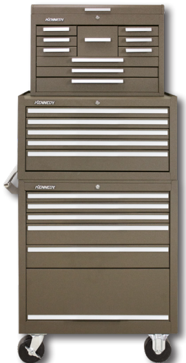
360 10-Drawer Chest 2805X 5-Drawer Chest 295X 5-Drawer Side Cabinet

Kennedy has the right combination for any industry.