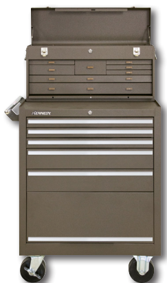
526 8-Drawer Chest 275X 5-Drawer Cabinet