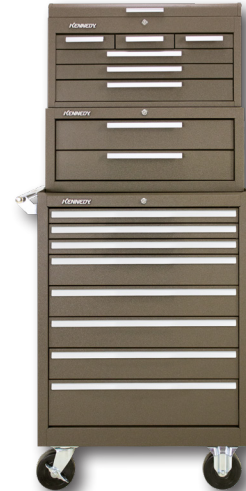
266 6-Drawer Chest 2602 2-Drawer Base 378X 8-Drawer Cabinet