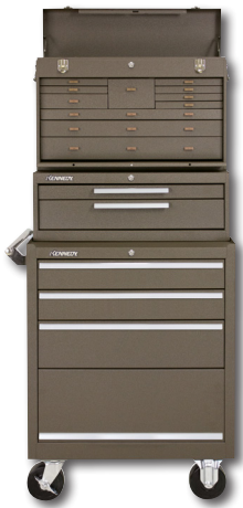
52611 11-Drawer Chest 5150 2-Drawer Base 273X 3-Drawer Cabinet