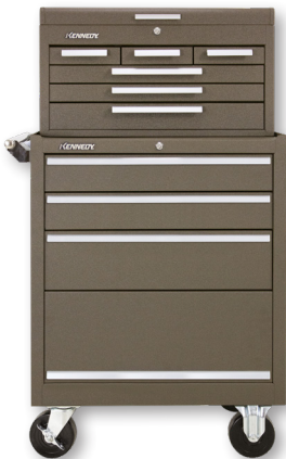
266 6-Drawer Chest 273X 3-Drawer Cabinet