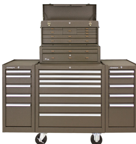
526 8-Drawer Chest MC28 2-Drawer Base 297X 7-Drawer Cabinet 205 5-Drawer Cabinet (x2)