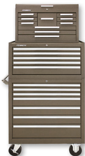
360 10-Drawer Chest 2805X 5-Drawer Chest 297X 7-Drawer Cabinet