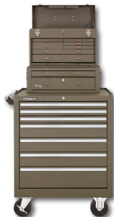
520 7-Drawer Chest MC22 2-Drawer Base 277X 7-Drawer Cabinet