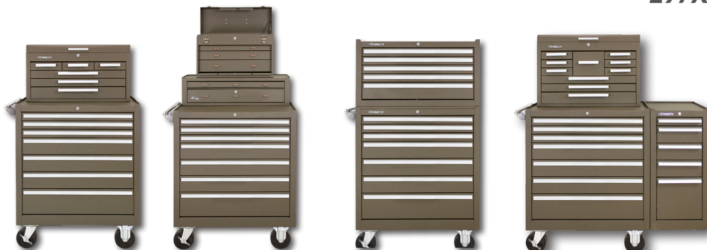
266 6-Drawer Chest 297X 7-Drawer Cabinet