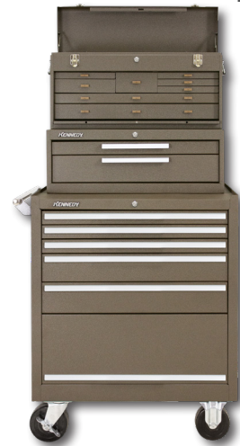
526 8-Drawer Chest 5150 2-Drawer Base 295X 5-Drawer Side Cabinet