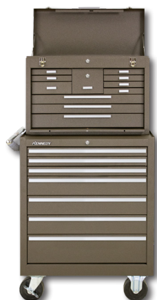
3611 11-Drawer Chest 277X 7-Drawer Cabinet