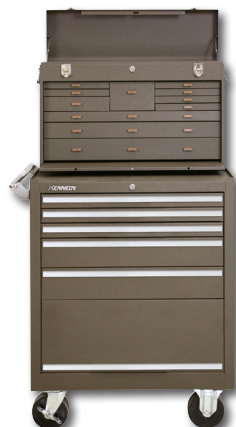
52611 11-Drawer Chest 275X 5-Drawer Cabinet