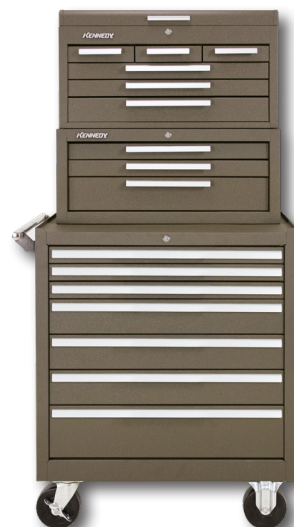
266 6-Drawer Chest 2603 3-Drawer Base 297X 7-Drawer Cabinet