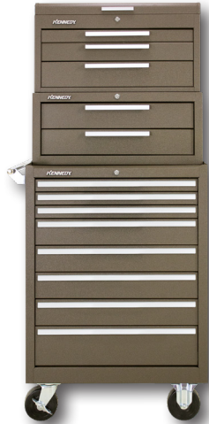
263 3-Drawer Chest 2602 2-Drawer Base 378X 8-Drawer Cabinet