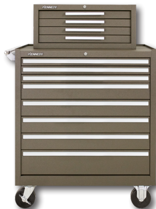
2604 4-Drawer Base 348X 8-Drawer Cabinet