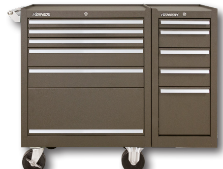
185X 5-Drawer Side Cabinet 275X 5-Drawer Cabinet Also Available in Industrial Red