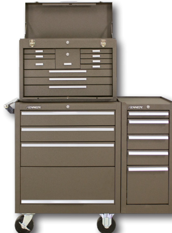
3611 11-Drawer Chest 273X 3-Drawer Cabinet 185X 5-Drawer Side Cabinet