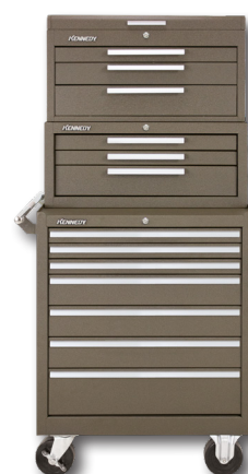
263 3-Drawer Chest 2603 3-Drawer Base 277X 7-Drawer Cabinet