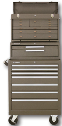
52611 11-Drawer Chest 5150 2-Drawer Base 277X 7-Drawer Cabinet