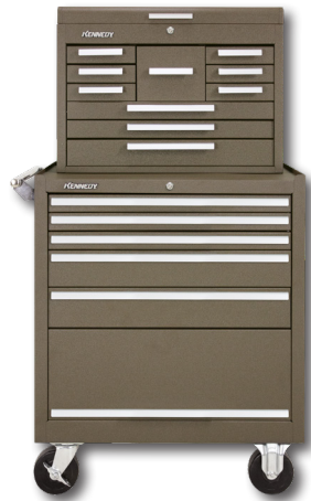
360 10-Drawer Chest 295X 5-Drawer Cabinet